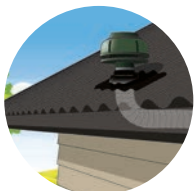
Roof Mounted Motor